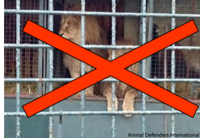
Animal Defenders International

the use of wild mammals, in travelling circuses should be prohibited across Europe.