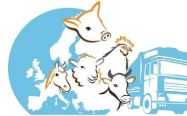
ANIMAL TRANSPORT GUIDES

WorldHorseWelfare Celebrating 90 years of helping horses