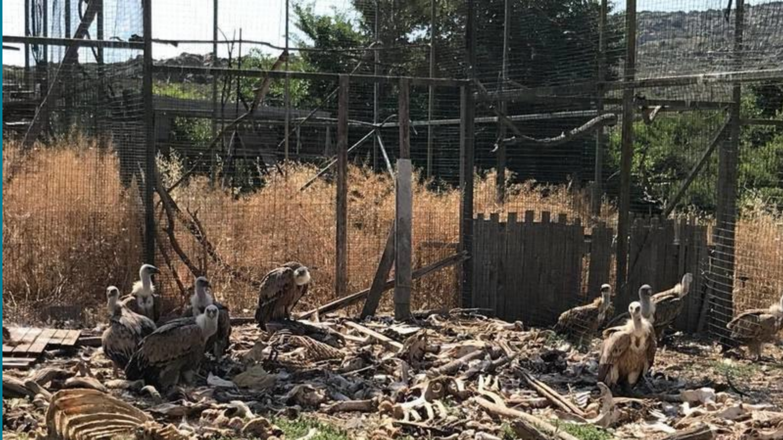
Greek Centre for the Protection of Wild Animals (EKPAZ)